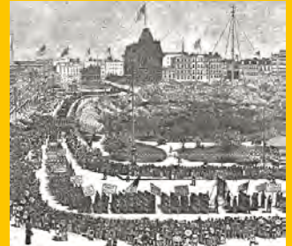
First Labor Day celebration, 1882. New York, New York.

Mid-to late twentieth century: As urban areas expand, suburbanization takes hold and parades become less popular. Labor Day's meaning gradually changes. It becomes the official last "free" summer week-end for everyone—children and adults. It is the reminder that now we all return to our labors: children to their learning, adults to their work, as summer ends and fall begins.